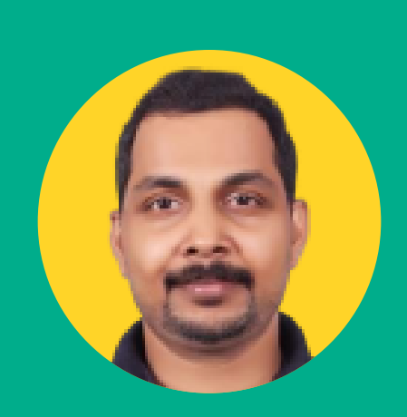
Saimon KS (Locations - UAE & India)

Past Employers: Etisalat - UAE, Meydan - UAE.