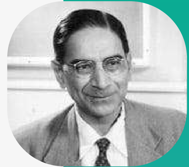
P C Mahalanobis