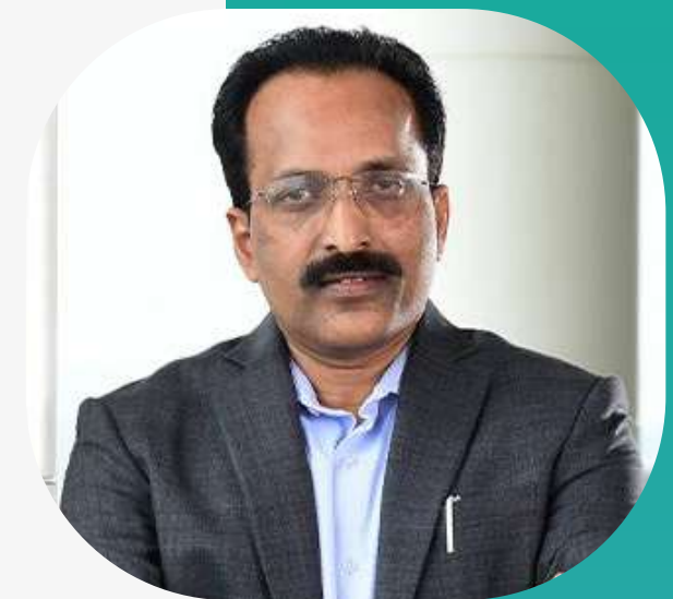
Dr. S. Somnath

▷ Scientist who is awarded Honorary Doctorate of Visvesvaraya Technological University in July 2024 Dr. S. Somnath (ISRO Chairman)