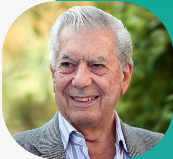
Mario Vargas Llosa