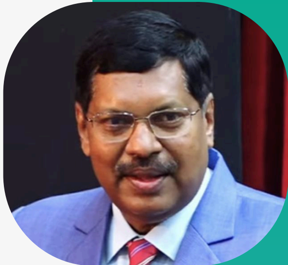
B. R. Gavai