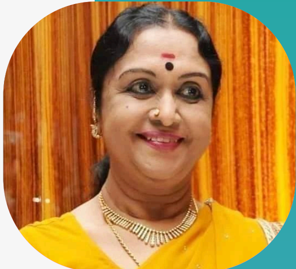
B. Saroja Devi