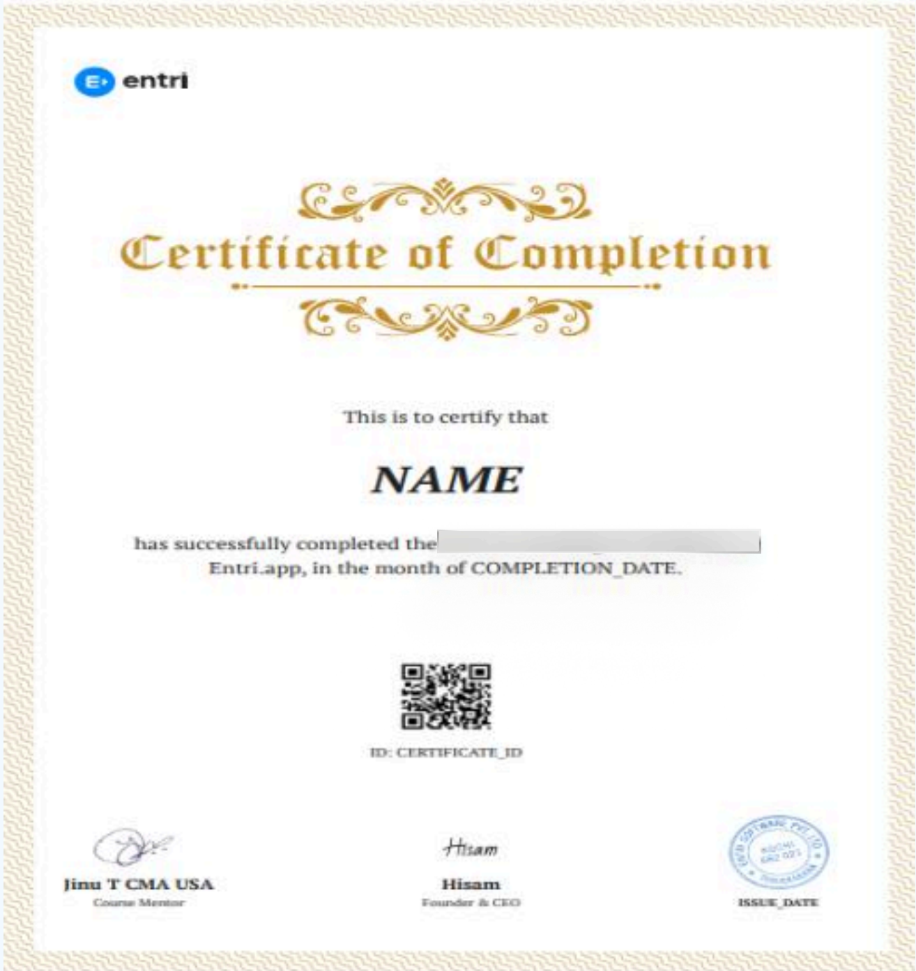
Entri Course Completion Certificate